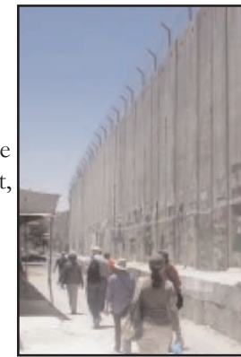
the wall surrounds Bethlehem

Bright Stars of Bethlehem is a 501c3 organization: 6957 Olde Creek Road, Suite 2300, Rockford, IL 61114