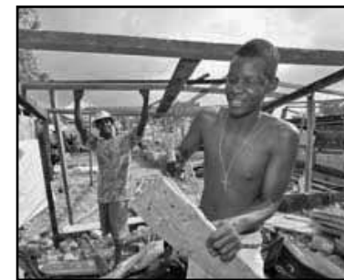
ELCA gifts to Haiti Earthquake Response have exceeded $3.6 million.