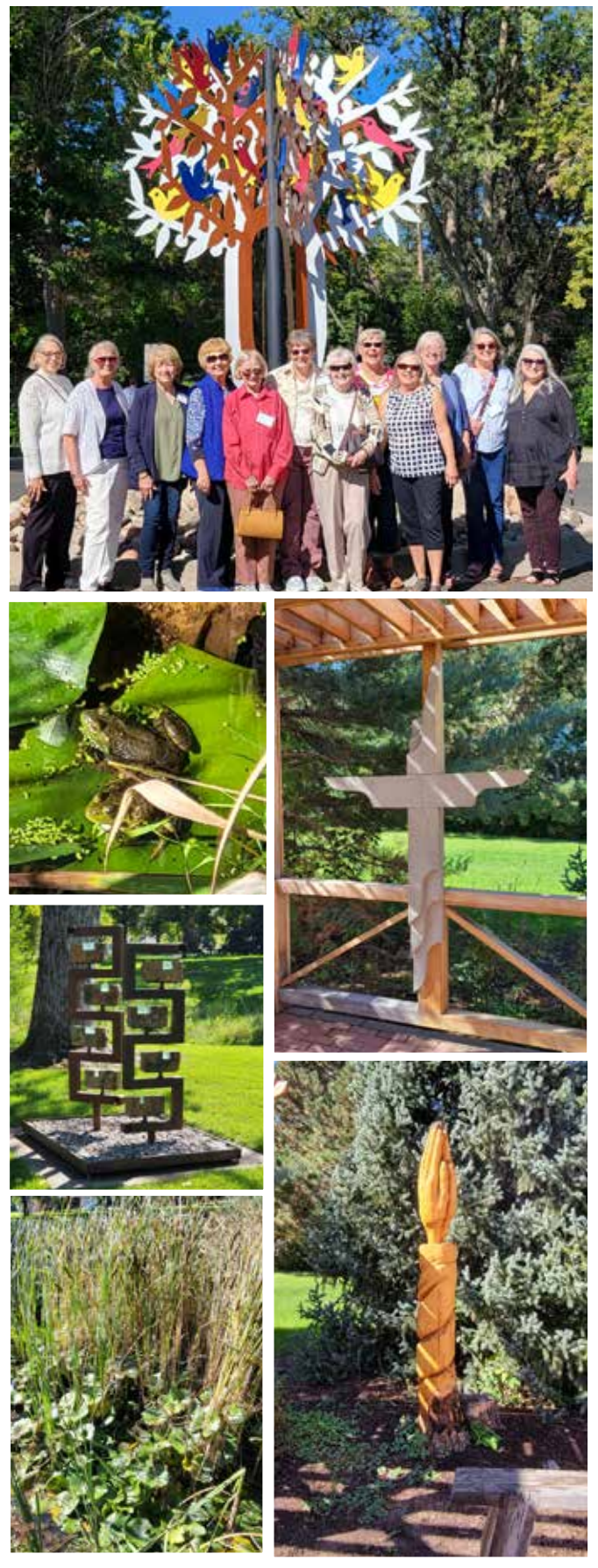
Views from the Rockies, December 2022