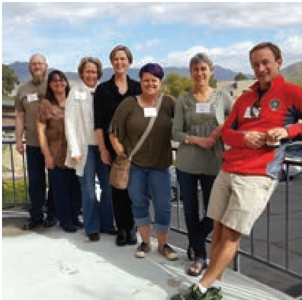
Rocky Mountain Synod leaders attend the Executive Skills for Church Leaders with California Lutheran University (see page D). Scholarships for this event are available through 3E!

If you are a rostered minister or candidate in the Rocky Mountain Synod, 3E is for you. 3E operates the Ministerial Excellence Fund that is for you. Do you have medical debt? College and seminary