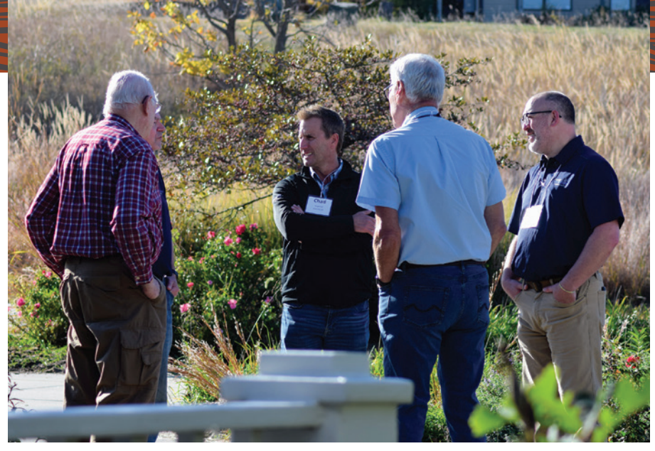
Bold Gathering, continued from page 1

reported on past and current God-filled initiatives in outreach, discipleship, stewardship, retreats, and communications. We reviewed LMM's three-year strategic plan across our many "spheres of influence," from Project XII and its popular, ongoing Lifelines series, to future One Year to Live Retreats and Bold Gatherings, to resource gathering and how best to use the financial and time and talent gifts at our mutual disposal. Ultimately, we came up with a way forward that's exciting and challenging and full of promise for LMM's continued health and growth. We also praved together, chowed down on some local barbecue, and even watched a little football — standard, fun, fulfilling fall bro-bonding stuff.